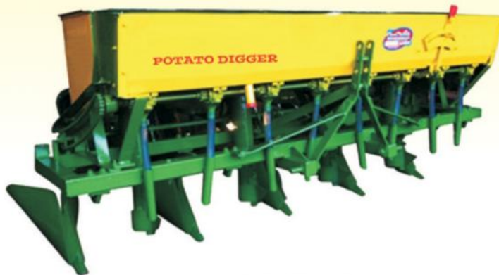
4 ROW PLANTER