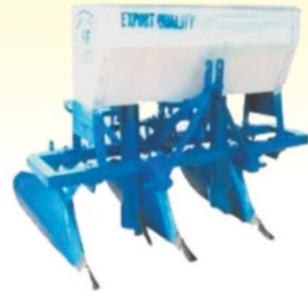
2 ROW PLANTER