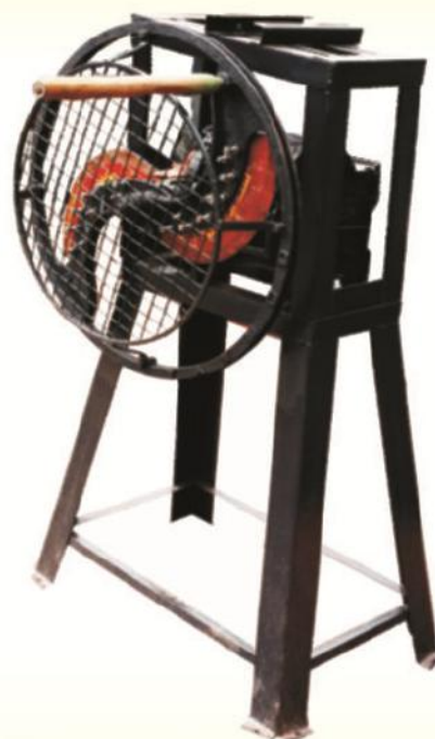
Grill & provision of Motor model